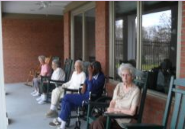
To All Our Beautiful Moms, "Happy Mother's Day."